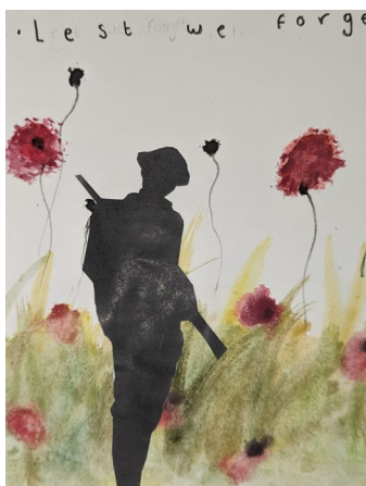
We raised a fantastic £359.42 in total from cash and online donations, as of lunchtime, for children in need, there is still time to donate here . Many of you have remarked on the fantastic display of Merton Poppies that were displayed in The Haymarket Centre in memory of those who have fought in past conflicts.