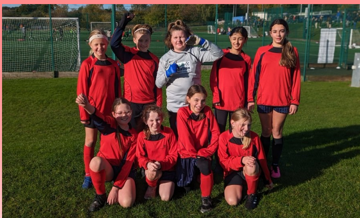
Well done to our Year 6 Girls football team for representing us at Charnwood at the Pokémon County Cup.