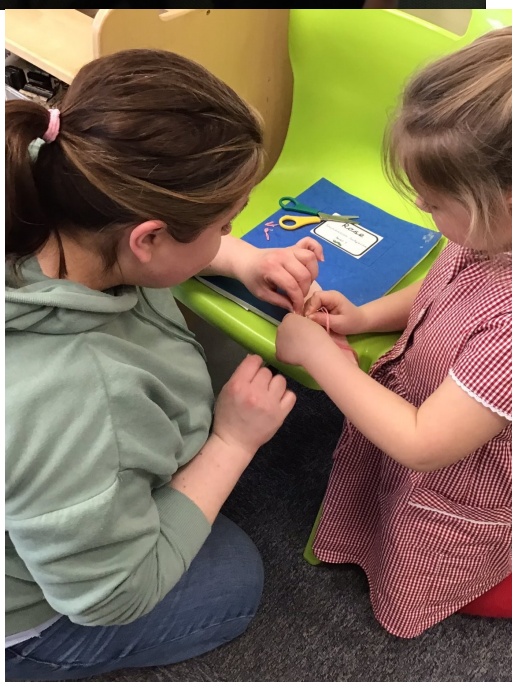
Puppet making in Year 1