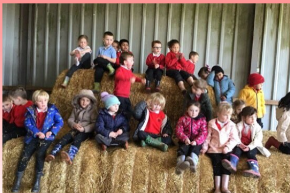
EYFS down on the farm...