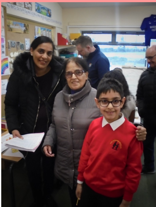
Year 3 families visit the museum