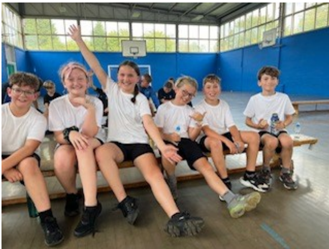
Year 6 Dodgeballers!

A Privet Hawk Caterpillar turned up in EYFS... they can move really fast!