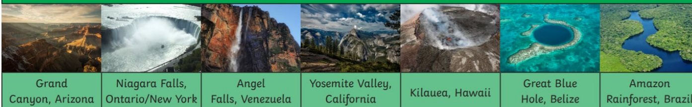
Grand Canyon, Arizona