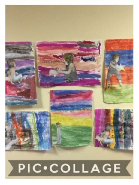
Key Stage 2 Art