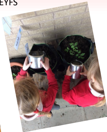
Planting Tomatoes in EYFS