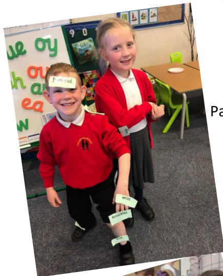
Parts of the human body in year 1