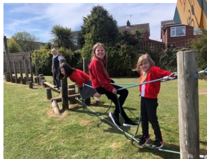
Collaborative play in Year 4 and collaborative Art in Year 3