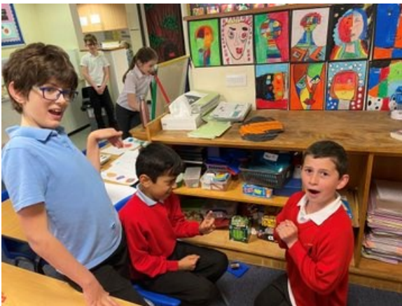
Acting out different Greek myths in Year 5!