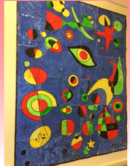
Collaborative art display inspired by Miro