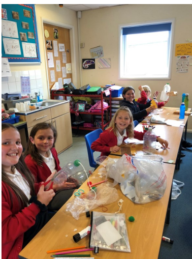
Year 4 busy making bird feeders and animal shelters to encourage local wildlife into our school grounds.

Year 6 have been doing some great work writing brochures on behalf of the New Zealand tourist board this past week. Look what came in the mail!