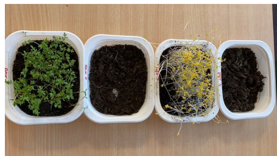
Year 2 learned that seeds need water to germinate but not sunlight. Although the plants without sunlight were very yellow!