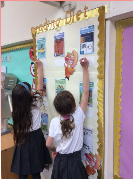
Year 3 children expanding their reading diet.

Perseverance and problem solving skills in year 1.