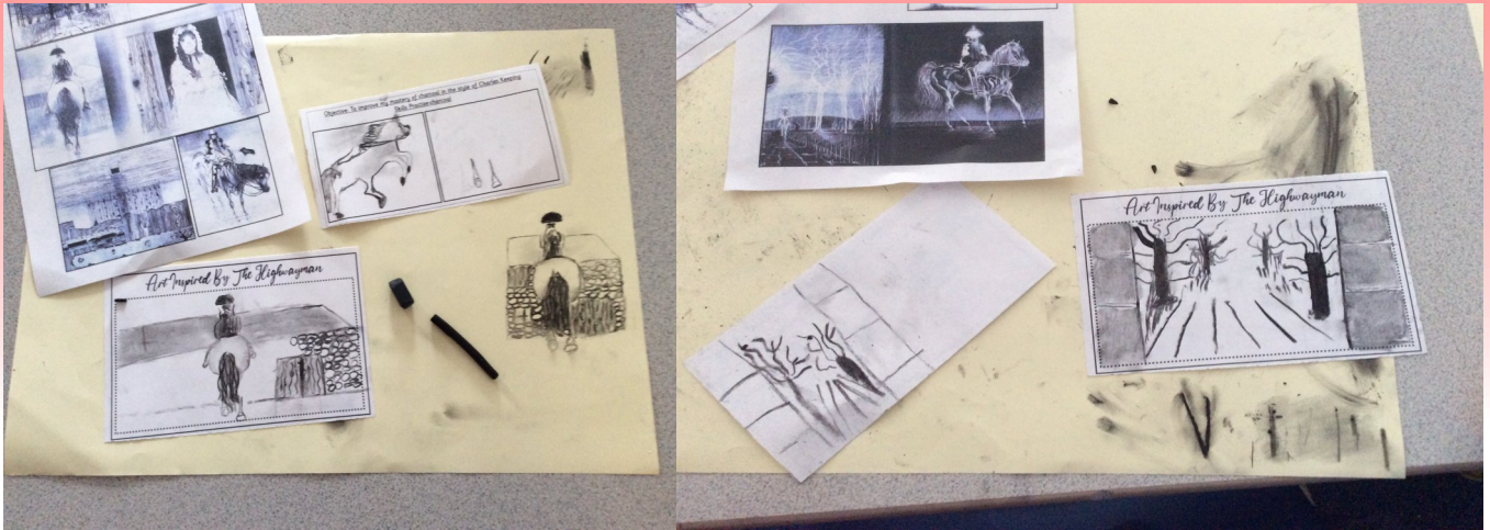
Year 6 Charcoal art inspired from the Highwayman poem.